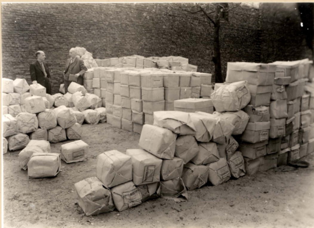
Osternhilfswerk der Jüdischen Sozialen Selbsthilfe