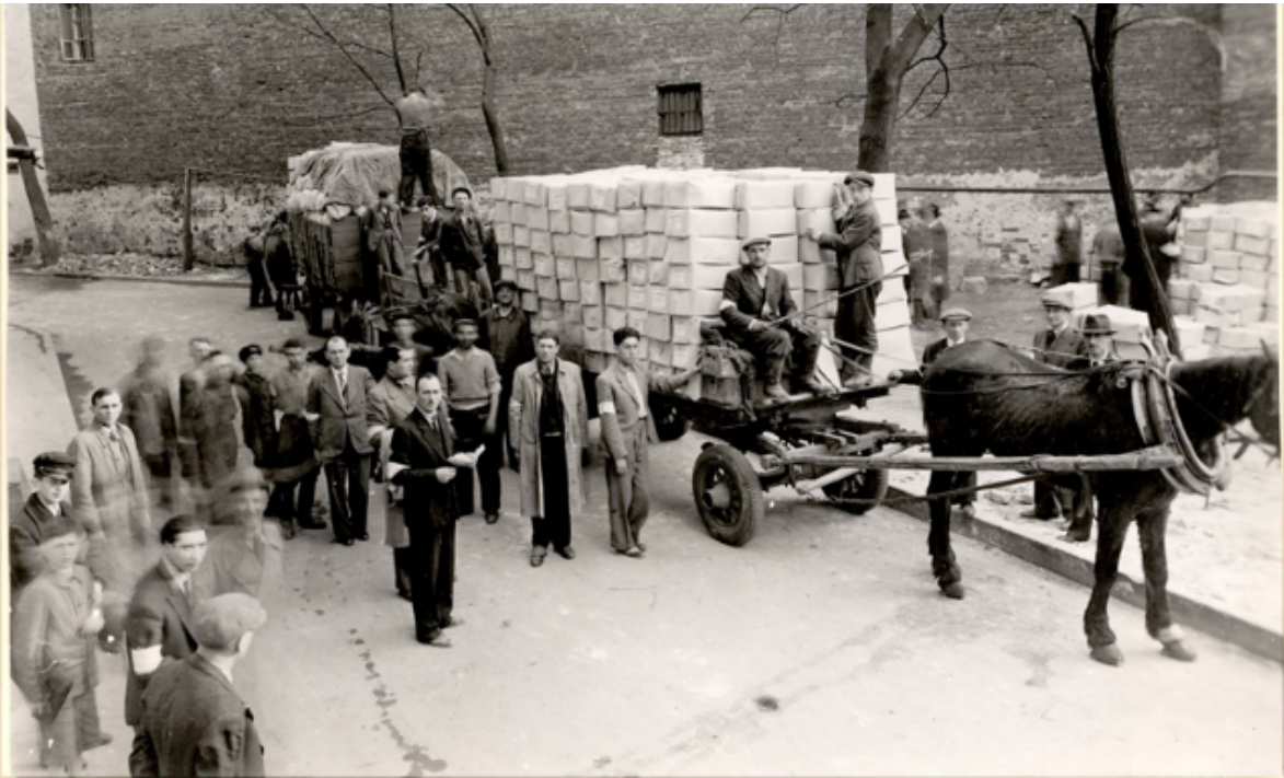
Osternhilfswerk der Jüdischen Sozialen Selbsthilfe

Due to a dispute over price, the “Joint” did not order matza from the Warsaw bakers choosing instead to buy from bakers in other towns and importing part of the supply from Rumania. A proportion of the flour and matza was subsequently confiscated in the towns and borders, and eventually much of the matza was only distributed during the holiday itself. This activity has been preserved for posterity in an album from the Jewish Self Help committee showing the various distributions, and the products including matza from Rumania.